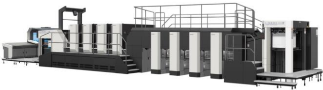
GLX-840RP+H-UV L (LED)