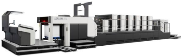
GLX-640+C+H-UV L (LED)