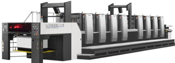
GL-837P+H-UV L (LED)